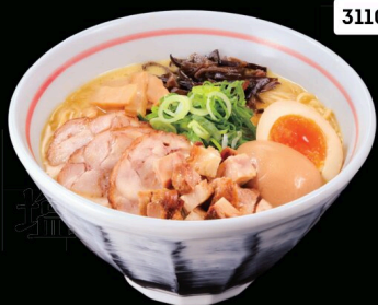
3110 Rich Chicken Paitan Ramen

Rich Chicken Paitan Ramen lets you fully indulge in a deeply concentrated broth, luxuriously extracting the rich umami of chicken.