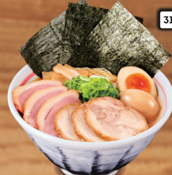
3136 Shoyu Special Deluxe Ramen

Sukiyaki-style beef slices, marinated egg, seasoned bamboo shoots, chopped green onion, nori sheet.