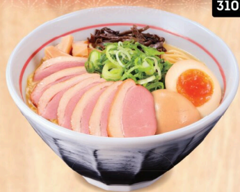
3102 ICHI-Chicken Paitan Smoked Duck Ramen

Sukiyaki-style beef slices, marinated egg, wood ear mushrooms, seasoned bamboo shoots, chopped green onion.