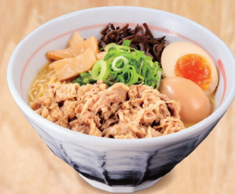
3104 ICHI-Chicken Paitan Beef Ramen

Chicken chashu, marinated egg, wood ear mushrooms, seasoned bamboo shoots, chopped green onion.