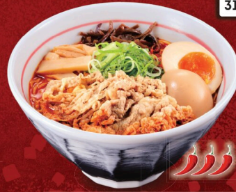
3124 Red Dragon Chilli Beef Ramen

Chicken chashu, marinated egg, original spicy paste, wood ear mushrooms, seasoned bamboo shoots, chopped green onion.