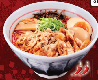
3126 Rich Red Dragon Chilli Beef Ramen

Chicken chashu, diced chicken chashu, marinated egg, original spicy paste, wood ear mushrooms, seasoned bamboo shoots, chopped green onion.