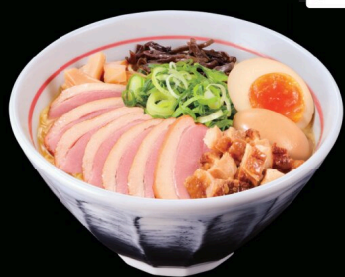
3112 Rich Chicken Paitan Smoked Duck Ramen

Sukiyaki-style beef slices, diced chicken chashu, marinated egg, wood ear mushrooms, seasoned bamboo shoots, chopped green onion.