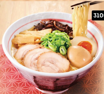
3100 ICHIKOKUDO Chicken Paitan Ramen

R $12.4 L $14.2 [1.5x more noodles] Select salt level: • Normal salt • Less salt