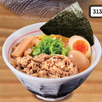
3132 Shoyu Beef Ramen

Double chicken chashu, marinated egg, seasoned bamboo shoots, chopped green onion, nori sheet.