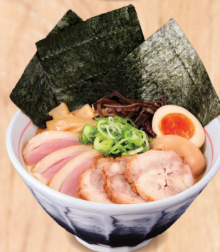
3106 ICHI-Chicken Paitan Special Deluxe Ramen

Smoked duck breast, marinated egg, wood ear mushrooms, seasoned bamboo shoots, chopped green onion.