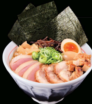
3116 Rich Chicken Paitan Special Deluxe Ramen

Smoked duck breast, diced chicken chashu, marinated egg, wood ear mushrooms, seasoned bamboo shoots, chopped green onion.