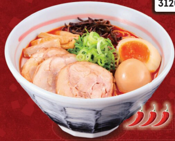
3120 Red Dragon Chilli Chicken Ramen

All the creamy richness of our signature chicken paitan ramen, now with a bold, spicy kick. A hearty bowl that combines deep chicken umami with satisfying heat.