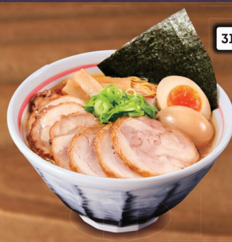
3134 Shoyu Double Chicken Chashu Ramen

Chicken chashu, marinated egg, seasoned bamboo shoots, chopped green onion, nori sheet.