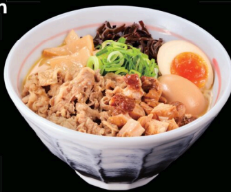
3114 Rich Chicken Paitan Beef Ramen

Chicken chashu, diced chicken chashu, marinated egg, wood ear mushrooms, seasoned bamboo shoots, chopped green onion.