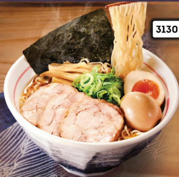
3130 Shoyu Chicken Ramen

A clear CHINTAN shoyu broth that brings out the natural umami of chicken. Light and refreshing in taste, yet layered with depth in every sip.