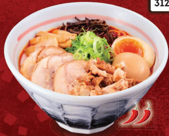
3122 Rich Red Dragon Chilli Chicken Ramen

Sukiyaki-style beef slices, marinated egg, original spicy paste, wood ear mushrooms, seasoned bamboo shoots, chopped green onion.